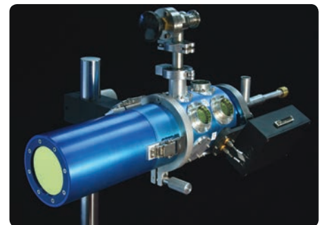
Flash X-ray (1E11rad(Si)/sec)