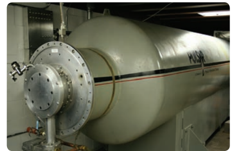
Focal Plane Array (FPA) Cryogenic Dewar