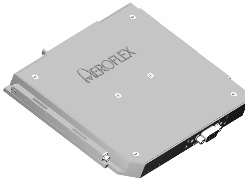
Figure 1 – Package Illustration